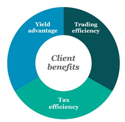
Figure 3. A measured approach to the initial invest-up period enhances long-term value

It's possible to invest portfolios more quickly by offering fewer state options and/or buying odd lots in the secondary market rather than by providing institutional-quality management. But this is not an effective long-term strategy, in our view. Buying odd lots may allow for some spread pickup, but these bonds will likely be difficult to sell at attractive prices when liquidity needs arise or during tax-loss harvesting, superseding any pricing advantage gained on the purchase.