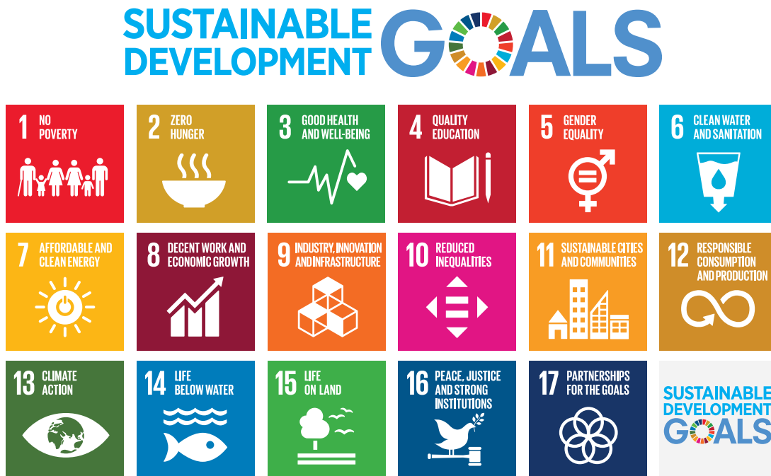
Figure 2: Nuveen’s investing approach is aligned with United Nations goals

Data source: United Nations Sustainable Development.