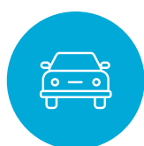
Figure 3: Infrastructure’s opportunity set

There is greater scope for diversification in public infrastructure. Investors can diversify across regions and countries, as well as sectors. This means investors can more easily tilt portfolios toward or away from specific themes. In addition, public infrastructure portfolios can be adjusted relatively quickly to adapt to varying market environments with factors such as beta or cyclicalities being fine-tuned.