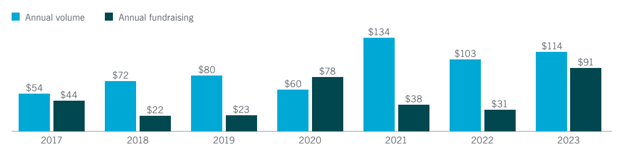
Figure 5: Transaction volume vs. annual fundraising ($bn)

Past performance does not guarantee future results.