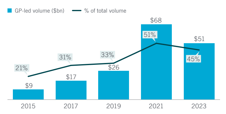
Figure 6: Growth within the GP-led secondaries market

Past performance does not guarantee future results. Data source: Evercore Private Capital Advisory — FY 2023 Secondary Market Highlights and published January 2024. Data as of 31 Dec 2023.