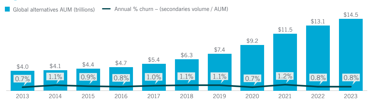
Figure 4: Global alternatives AUM vs. annual churn rate

Past performance does not guarantee future results.