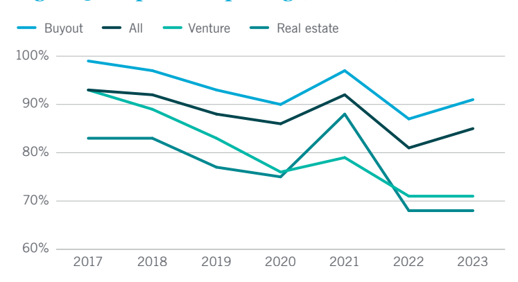
Figure 3: LP portfolio pricing (% of NAV)

Past performance does not guarantee future results.