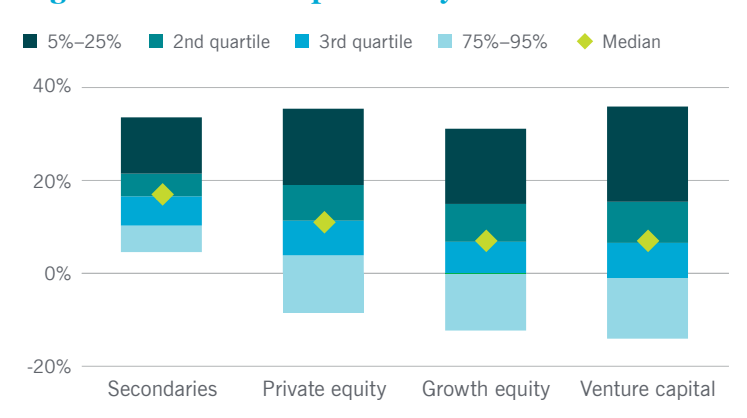
Figure 8: Net IRR dispersion by asset class

Past performance does not guarantee future results.