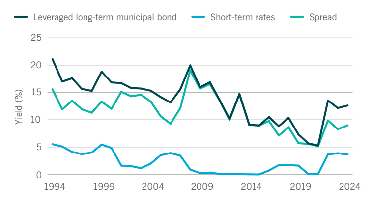
Figure 1: Leveraged yields have trended lower, but remain positive

Performance data shown represents past performance and does not predict or guarantee future results. Representative indexes: municipal bond: Bloomberg Municipal Long Bond Index; short-term rates: Securities Industry and Financial Markets Association (SIFMA).